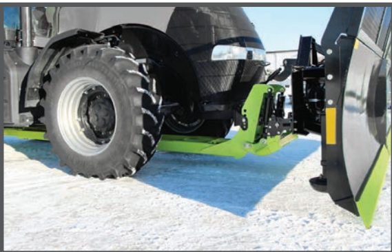
- FM-350 with SV Plow -

Enjoy the convenience, comfort and improved performance of a front mounted snow blower. No matter how much snow you need to move you will appreciate the FM-350. The FM-350 gives you the ability to mount your 3pt snow blower or SV Plow on the front of your tractor instead of on the tractor's rear 3pt hitch. The FM-350 offers you better visibility and ergonomics when coupled with a Schulte Snow Blower. Blowing snow while driving forward, is more efficient than blowing snow in reverse. The FM-350 allows you an increased selection of travel speeds, as your tractor has many more forward gears than reverse gears. This increased gearing selection will result in better snow blowing performance and less wear and tear on the tractor clutch, and your neck.