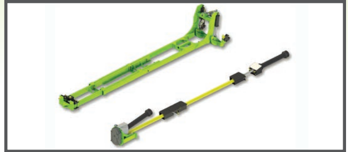
- Rear Hitch or Optional Drivetrain -

that the snow blower fits as close to the tractor as possible. A high degree of adjustability allows the frame to accommodate different sizes of tractor tires while still maintaining the best possible ground clearance. Telescoping frame sections and telescoping drive line components allow the FM-350 to fit tractors between 151 and 211" long, measured from the front mounting plate to the tractor drawbar pin.