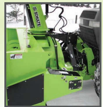
- Draw Bar Mount & PTO Power -